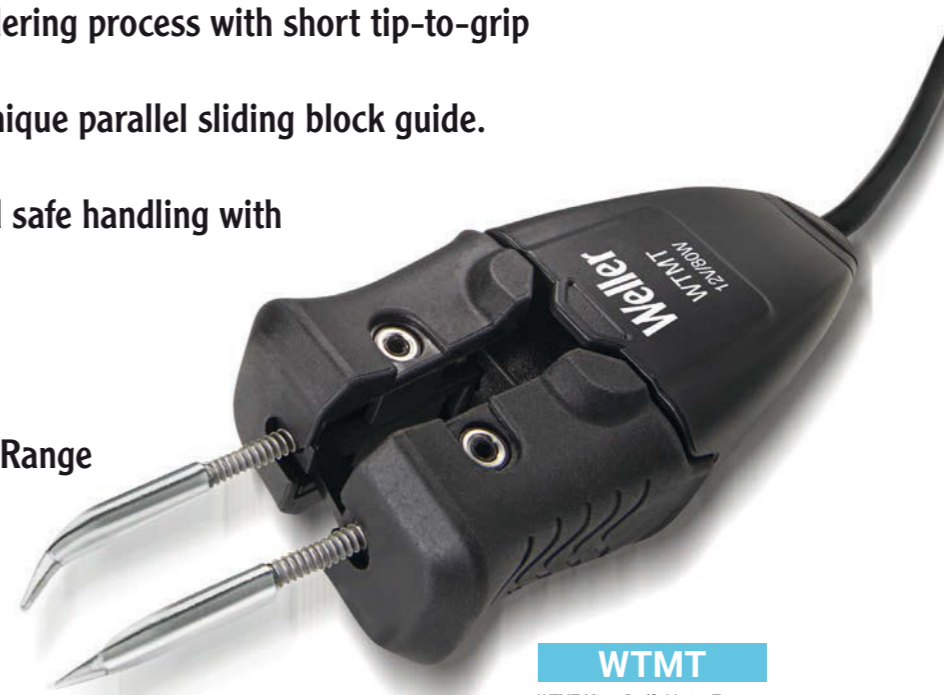
WTMT WTMT Micro De/Soldering Tweezer (hand piece without tips) 2 x 40 W, 12 V Order No. T0051321199